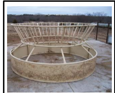
Figure 2. Modified cone feeder.

In the previous Missouri research, 1 the effect of bale feeder design (open vs. chain cone) and forage quality on hay waste was evaluated. The two forage qualities evaluated were alfalfa haylage (high quality: HQ, 41% DM and 17% CP) and fescue hay (low quality: LQ, 92% DM and 7.5% CP). These researchers reported that percent bale waste with LQ forage was 19.2% in open feeders vs. 8.9% in cone feeders. Whereas, with HQ forage, hay waste did not differ between feeders designs (7.0% vs. 6.5% for open and cone feeders, respectively). In the Oklahoma research, 2 hay waste (low quality prairie grass hay) with four different bale feeder designs was 21.5, 20.6, 12.7, and 5.6% with an open bottomed polyethylene pipe ring, an open bottomed steel ring, a sold bottomed steel ring, and a modified cone feeder (Figure 2), respectively.